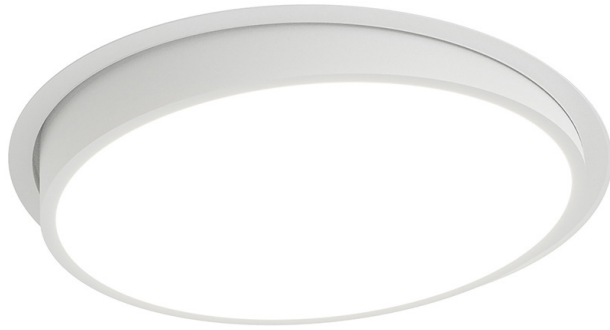
Satin Ice (SI) Flat Lens and 5° vertical tilt shown.