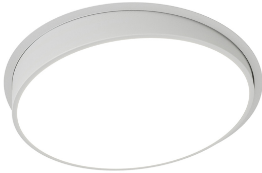
Satin Ice (SI) Flat Lens and 5° vertical tilt shown.